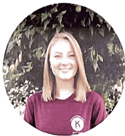
Governor Kacie Iverson