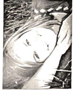
Governor Natalie Sitter